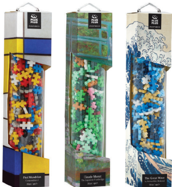
Composition A Japanese Footbridge The Great Wave

Explore where creativity takes you with our all-new collection inspired by iconic works of art.