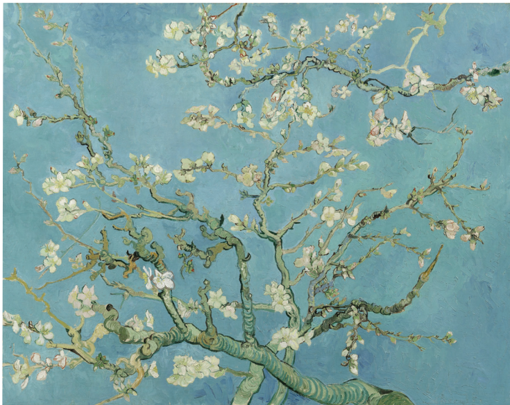
Almond Blossom Oil on canvas, c. 1890 36 x 28.9 in / 73.3 x 92.4 cm Van Gogh Museum (Amsterdam, Netherlands)

VINCENT VAN GOGH b. 1853, Groot-Zundert, Netherlands; d. 1890, Auvers-sur-Oise, France