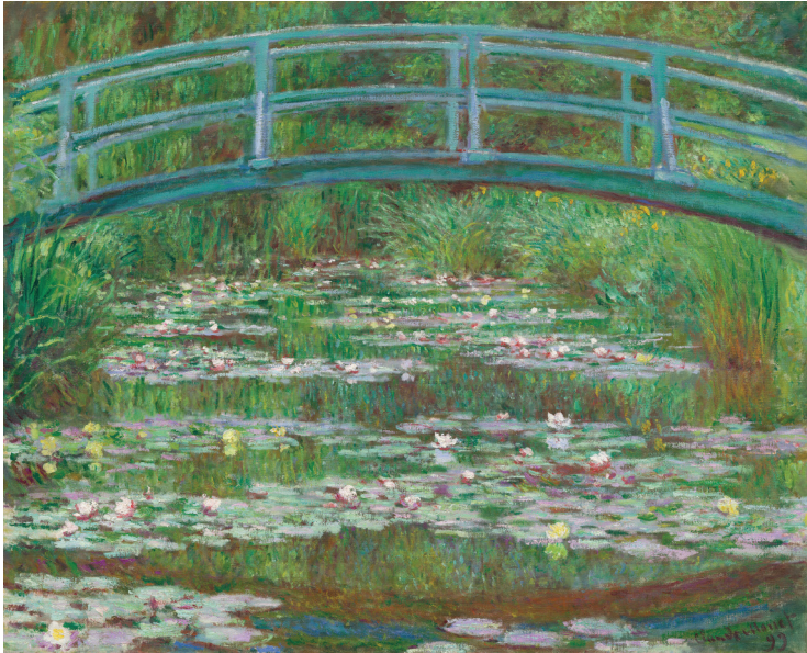
The Japanese Footbridge Oil on canvas, c. 1899 32 x 40 in / 81.3 x 101.6 cm National Gallery of Art (Washington D.C., United States)

CLAUDE MONET b. 1840, Paris, France; d. 1926, Giverny, France